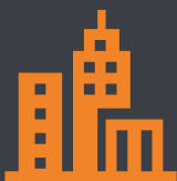
Taxation of Major Corporates

The Institute of Chartered Accountants England and Wales (ICAEW) and the Chartered Institute of Taxation (CIOT) have developed a joint programme which enables you to achieve both the ACA and the CTA qualifications in four years. The programme is a unique and efficient route for students who want to specialise in one of three areas of taxation: