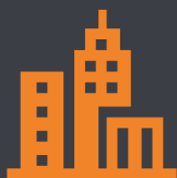
Taxation of Major Corporates

The Institute of Chartered Accountants England and Wales (ICAEW) and the Chartered Institute of Taxation (CIOT) have developed a joint programme which enables you to achieve both the ACA and the CTA qualifications in four years. The programme is a unique and efficient route for students who want to specialise in one of three areas of taxation: